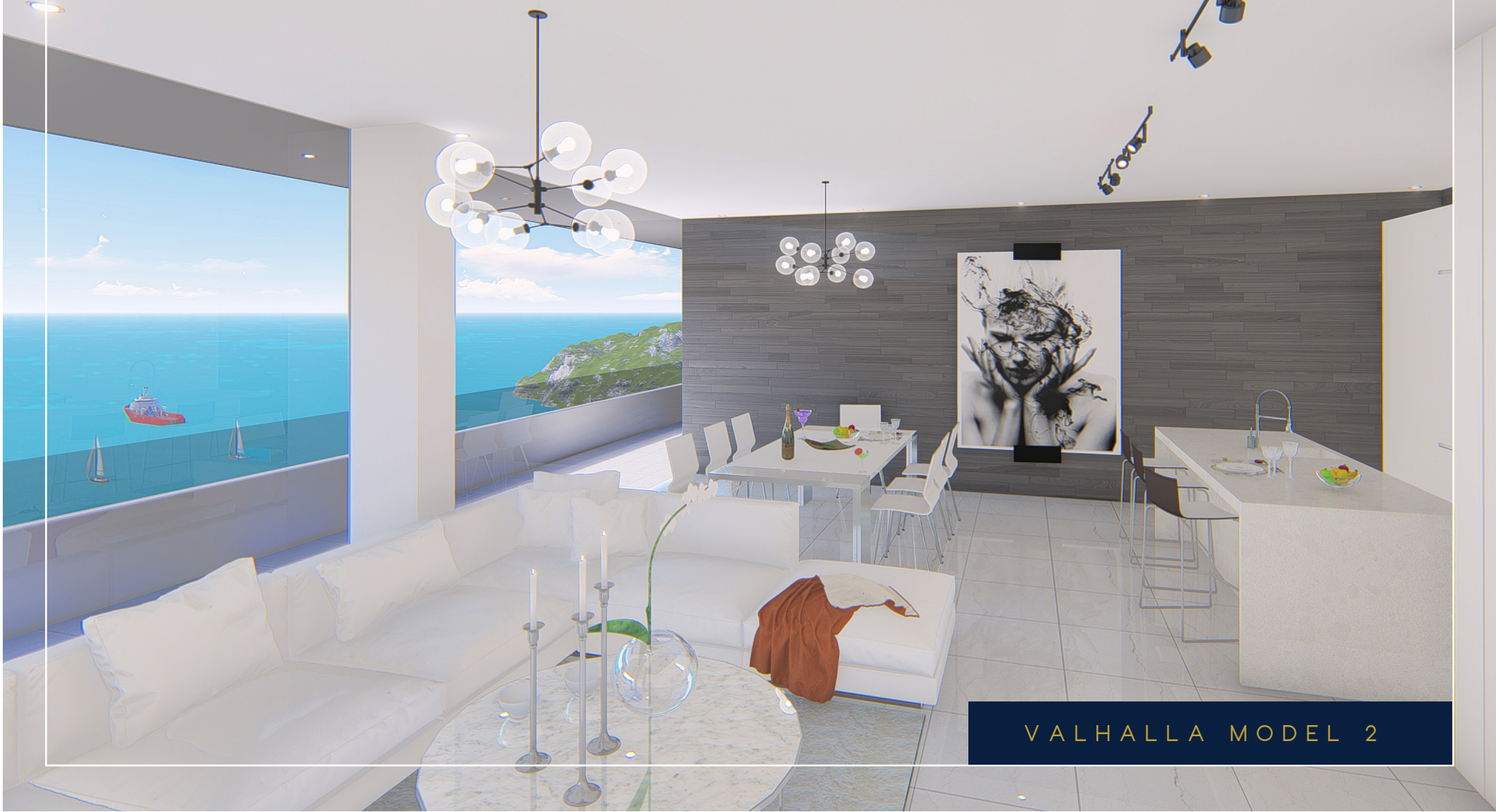
VALHALLA MODEL 2

Royal Mill ***** ST. VINCENT AND THE GRENADINES