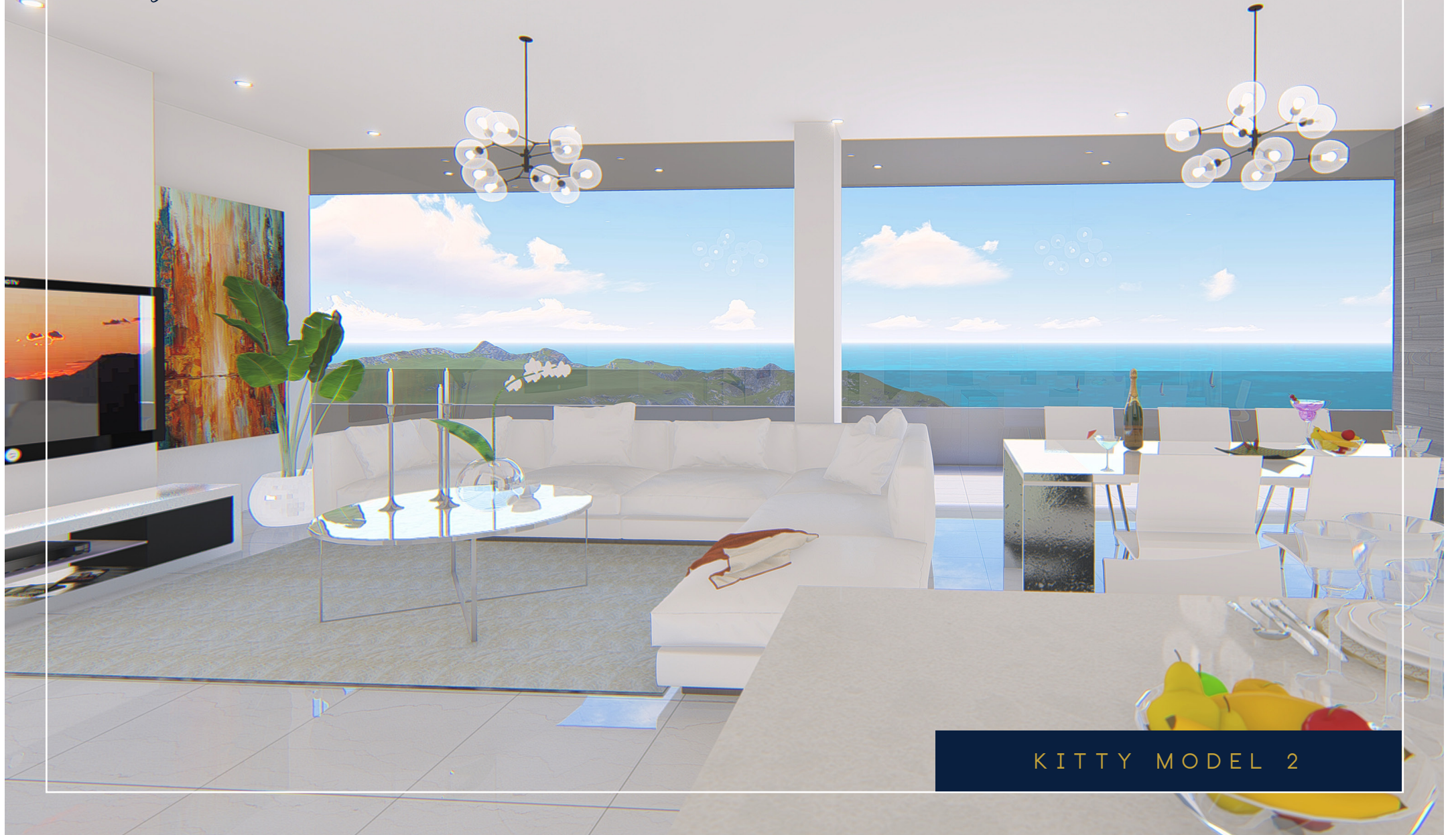
KITTY MODEL 2